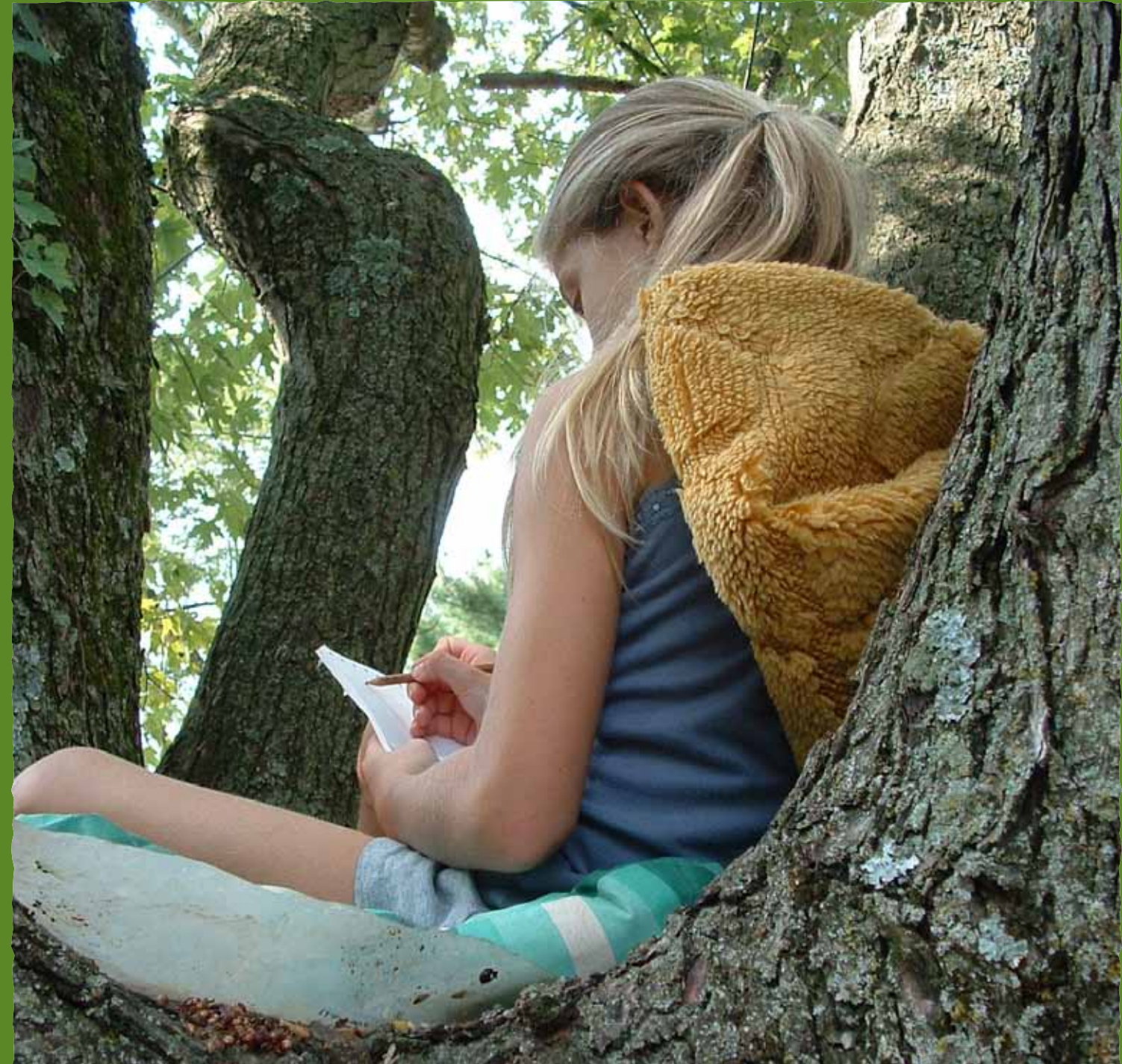
LITTLE SPROUTS PHOTO CONTEST — NICKI (6) IN HER NEST — SUBMITTED BY JIM & NORMA HORN, ST. LOUIS